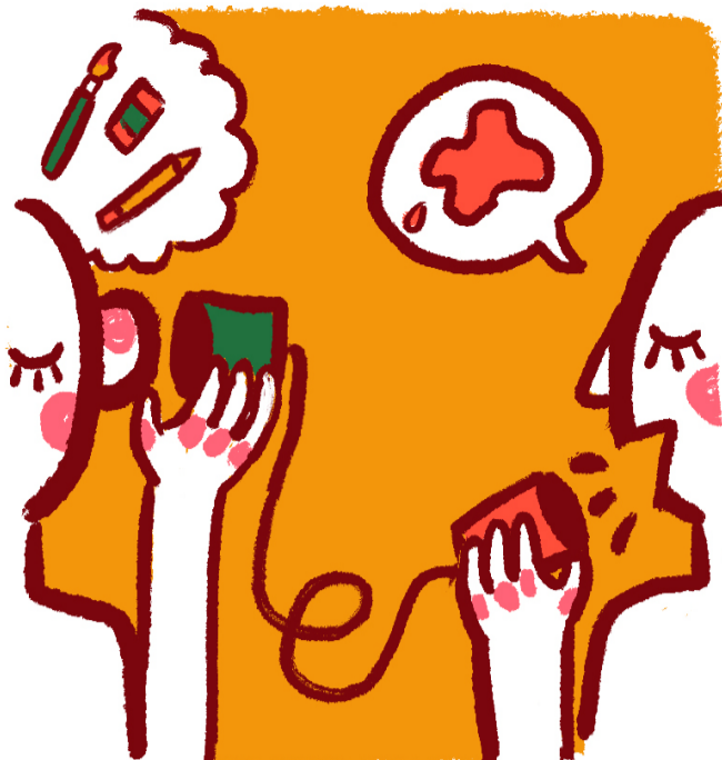
#2: Art communicates, in every sense