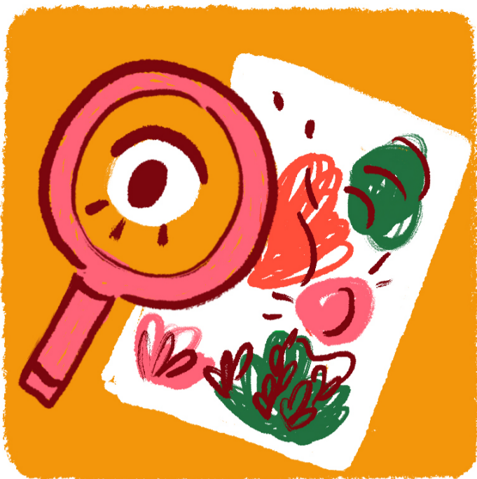
#1: Artists make marks, drawing our attention