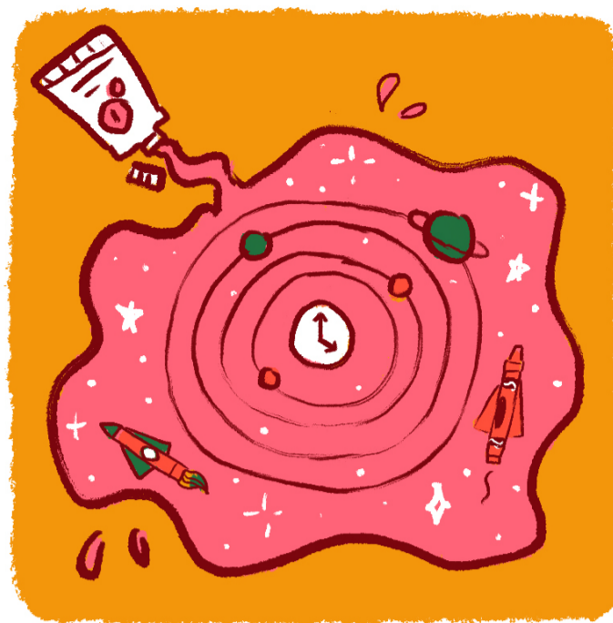
#3: Art has its own vocabulary shaped across time and space