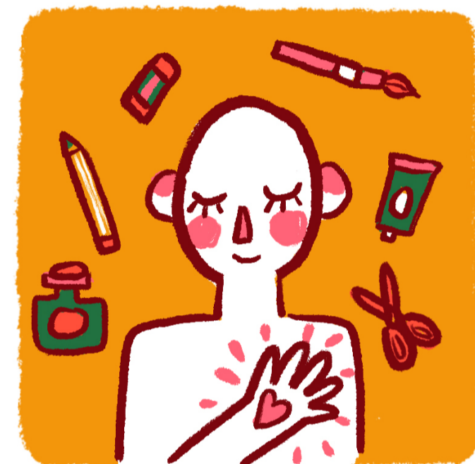
#6: Art engages; head, heart and hands