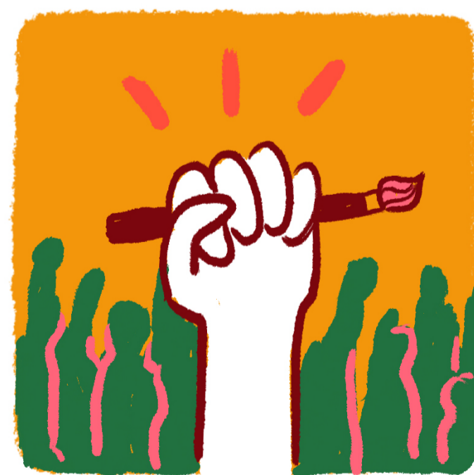
#9: Art makes people powerful, for good and bad