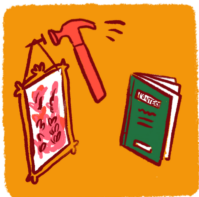
#7: Art is not fixed in meaning; context is everything