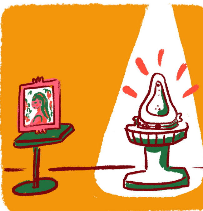
#8: Art has value; in unequal measures