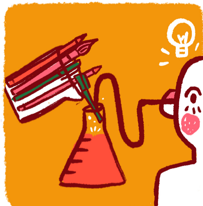
#5: Artists play with ideas, materials and failure